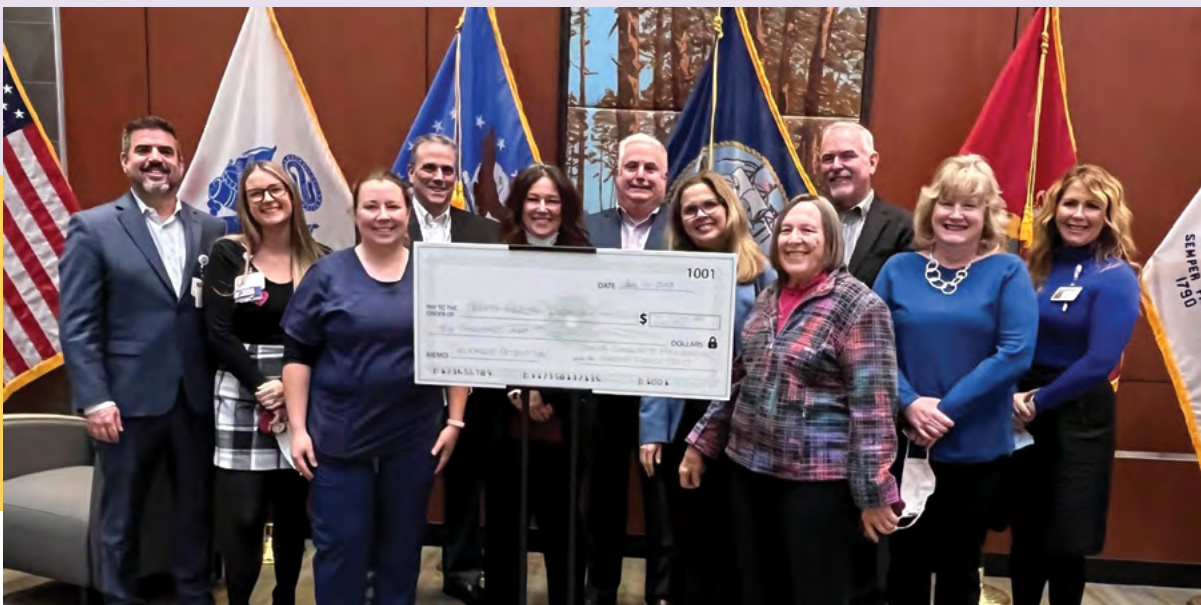
Members of the Livonia Community Foundation team presented a check to Trinity Health Livonia leadership.