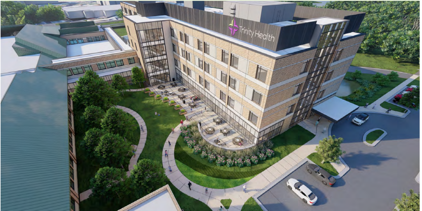
Rendering, exterior of the new Trinity Health Livingston Hospital with courtyard and direct access to Trinity Health Medical Center - Brighton, to create easy access and a healing environment for our community.

“...philanthropy for this project will help to forge our future.”