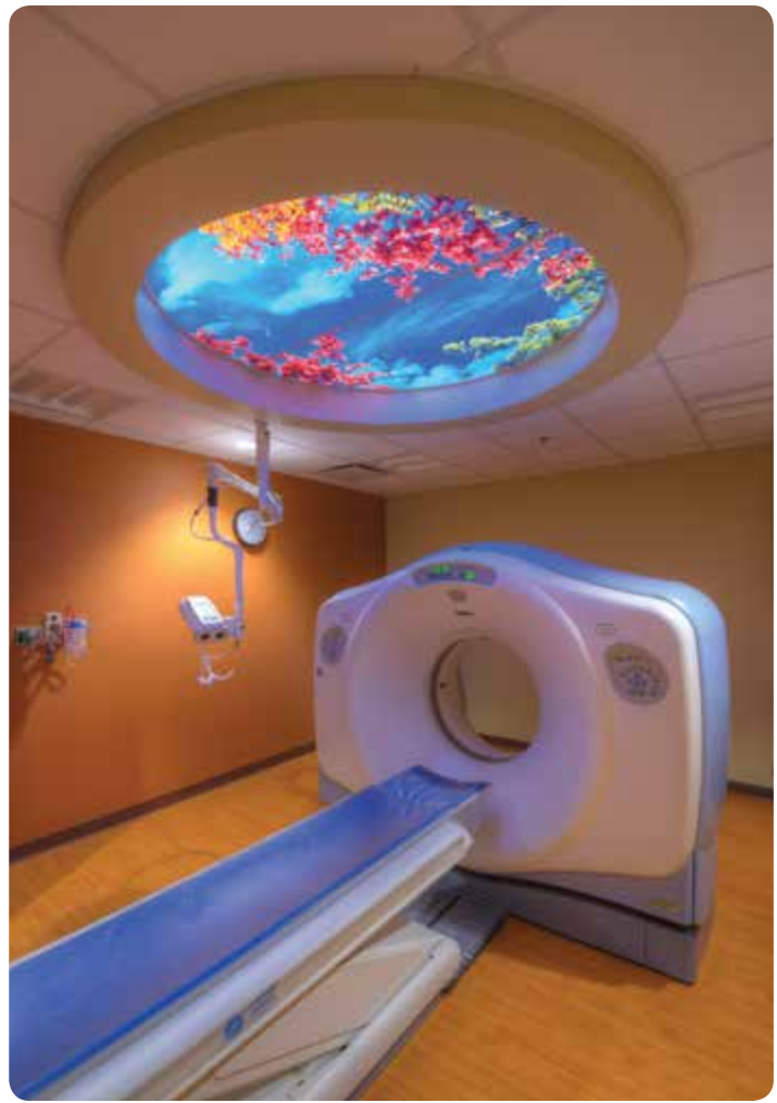
The CT Scanner at St. Joe's Chelsea is used to diagnose a stroke.

Philanthropy is, at the heart, a community endeavor. The outcomes of our patients in the Emergency Department are not solely dependent on one individual provider but the result of our personnel working collectively as a team.