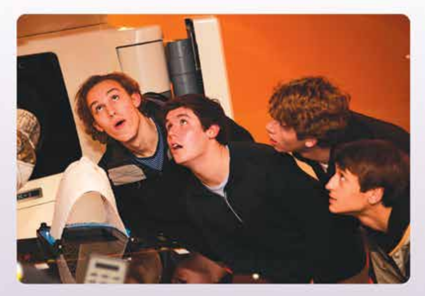
Students from the Brighton Area Schools Leadership Class were amazed by the Linear Accelerator for targeted radiation therapy.