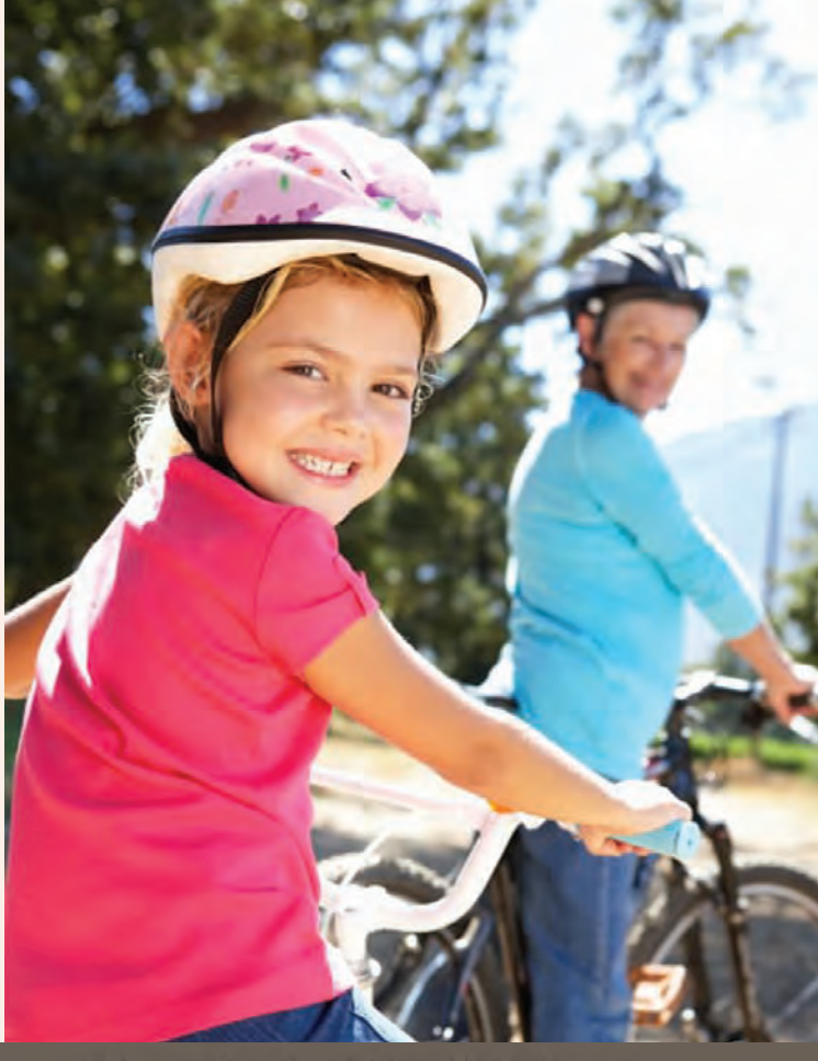
for donors of Saint Joseph Mercy Health System