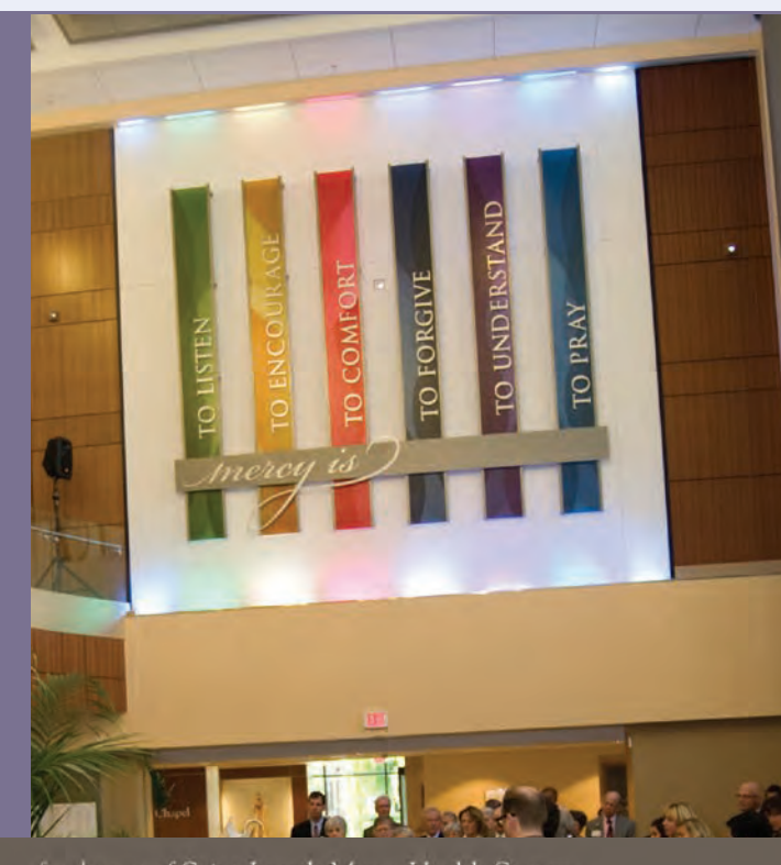
for donors of Saint Joseph Mercy Health System

The Mercy banner hung in the grand lobby is a reminder of our core values.