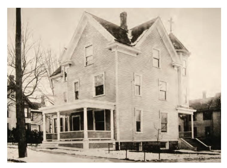
1911 first St. Joe's Hospital on State Street

To learn about how ongoing support makes a difference, visit: stjoeshealth.org/giving