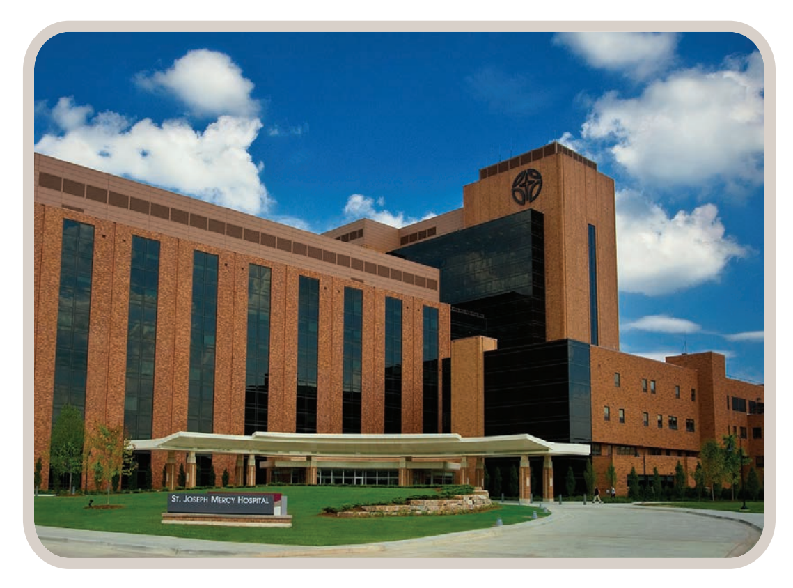
The new entrance at St. Joseph Mercy Ann Arbor

"St. Joseph Mercy Hospital's centennial is a perfect time to reflect on the generosity that the Sisters of Mercy and the Hospital have received from the community over the years, and the tremendous gift they have given us in