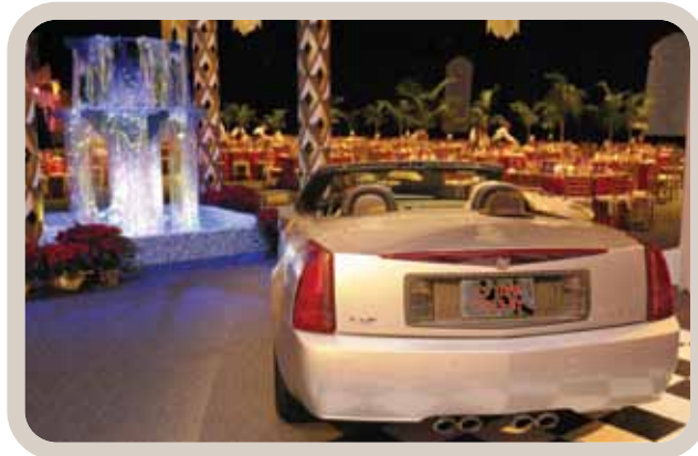
The XLR convertible, provided by presenting sponsor Cadillac for the 2007 event with the theme "As Time Goes By," is symbolic of ongoing support for the Holiday Ball.