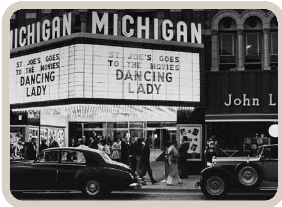
"St. Joe's Goes to the Movies" was the theme of the first St. Joe's Holiday Ball held in 1976.