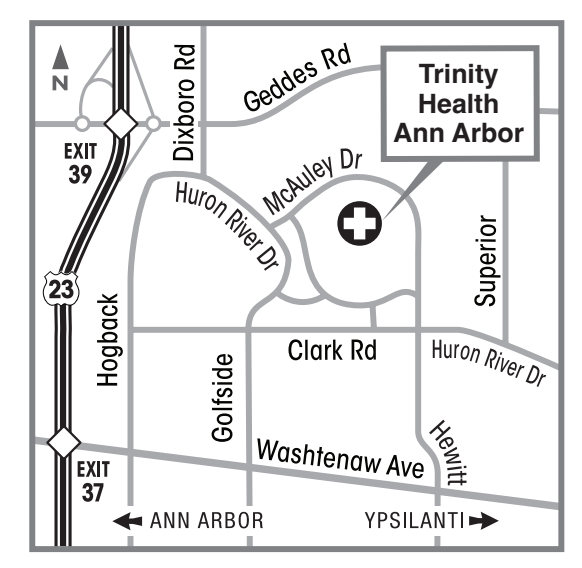
Trinity Health Ann Arbor campus follow signs to the Administration Area/ Sleep Disorders Center